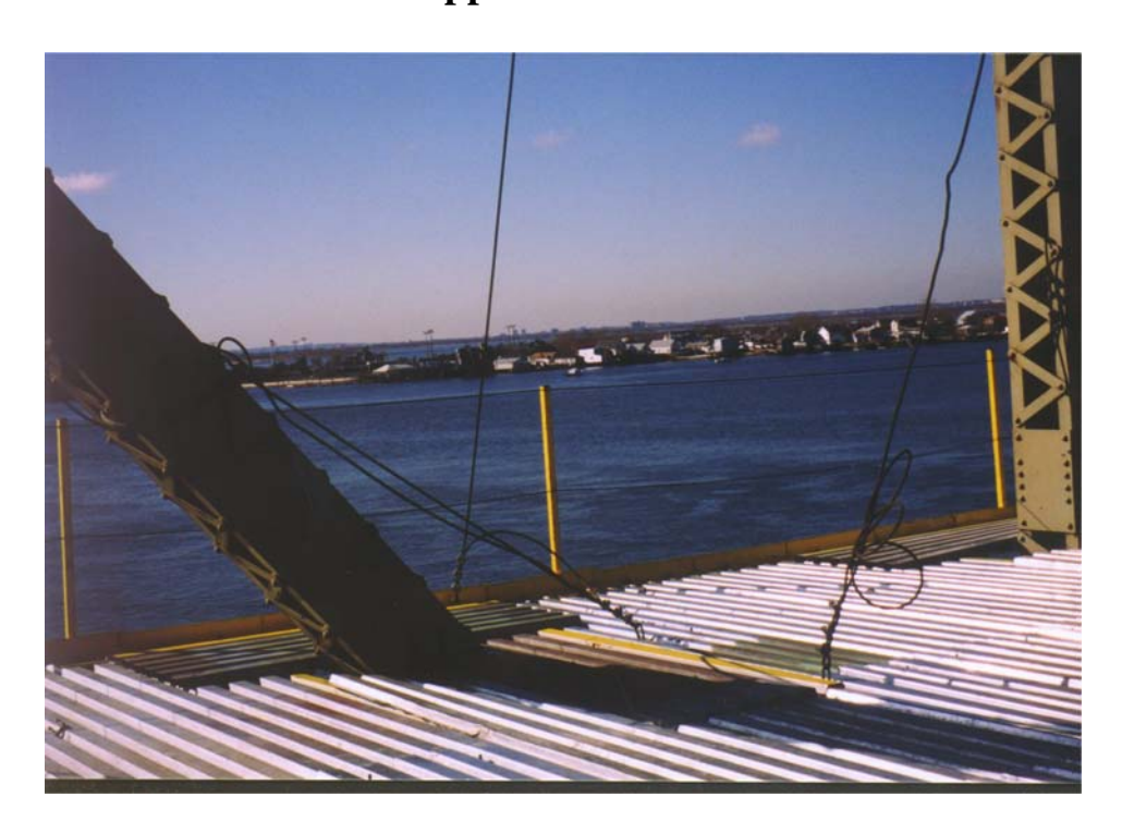
Intermediate Cable Supported Platform