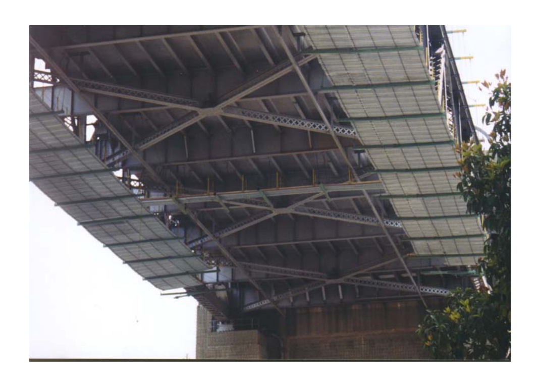
Lower Truss Chord Platforms