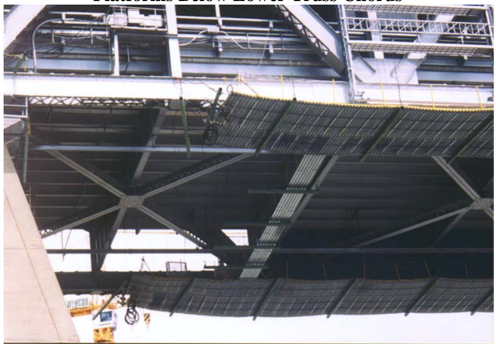
Platforms Below Lower Truss Chords & End Connection