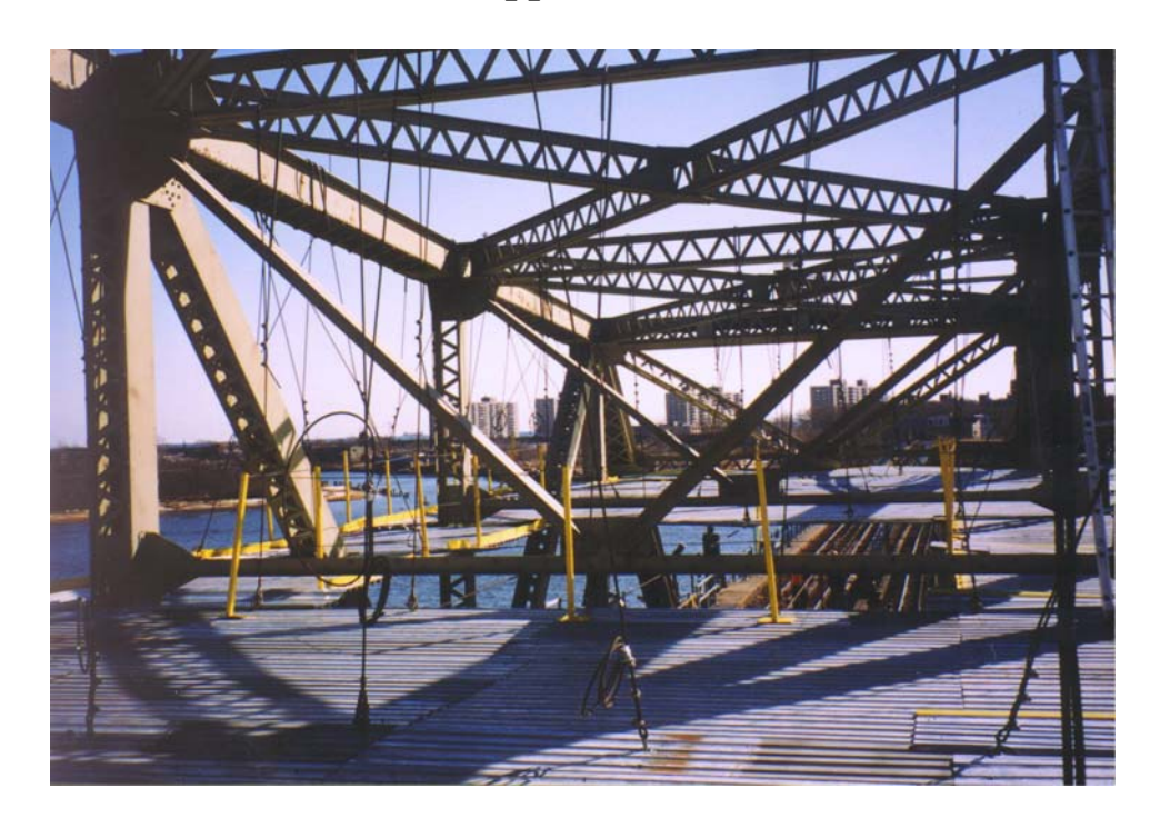
Intermediate Level Cable Supported Platform