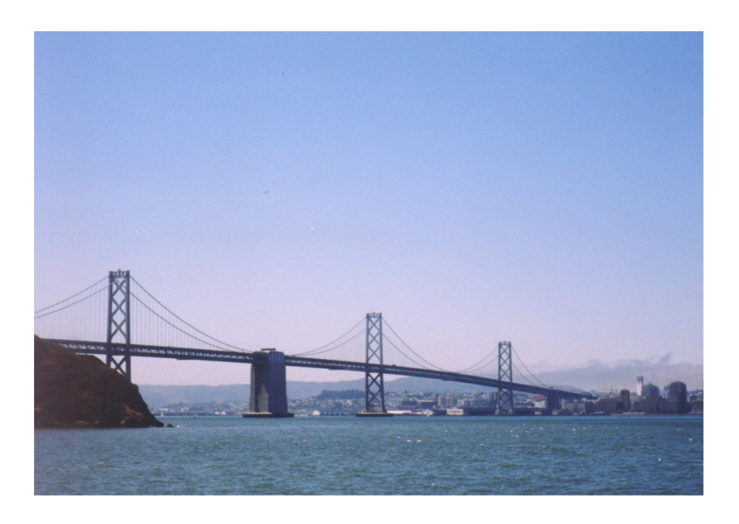
Cable Supported Platform