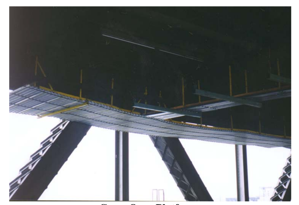
Cross Over Platforms