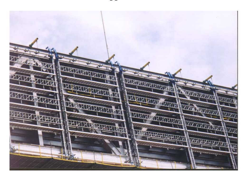
Cable Supported Platform/Scaffold