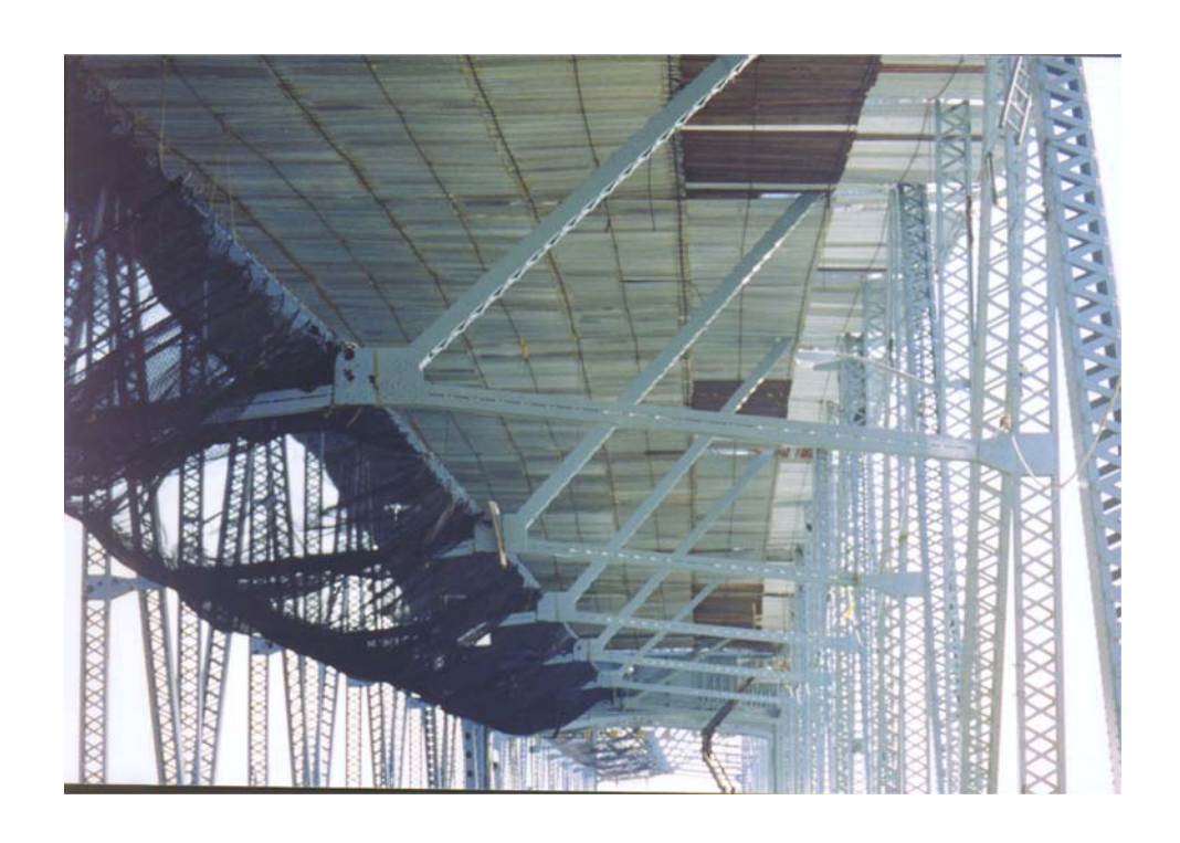
Upper Level Platform & Debris Netting