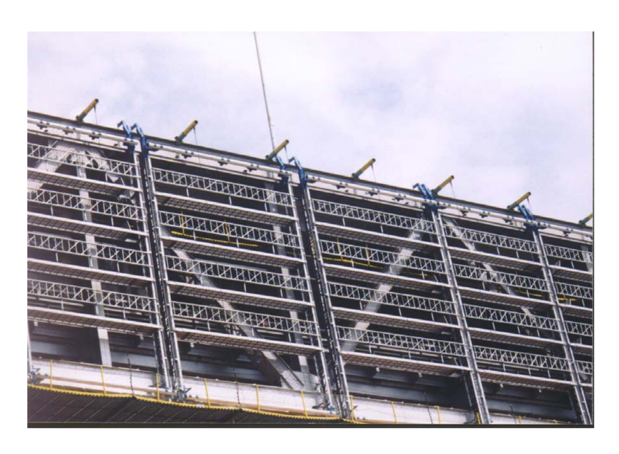
Lower Truss Chord Platforms Scaffolding