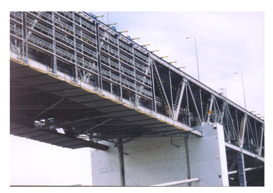
Platforms Below Lower Truss Chords