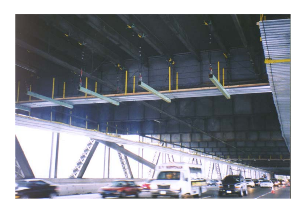
View Showing Cross Over Platforms