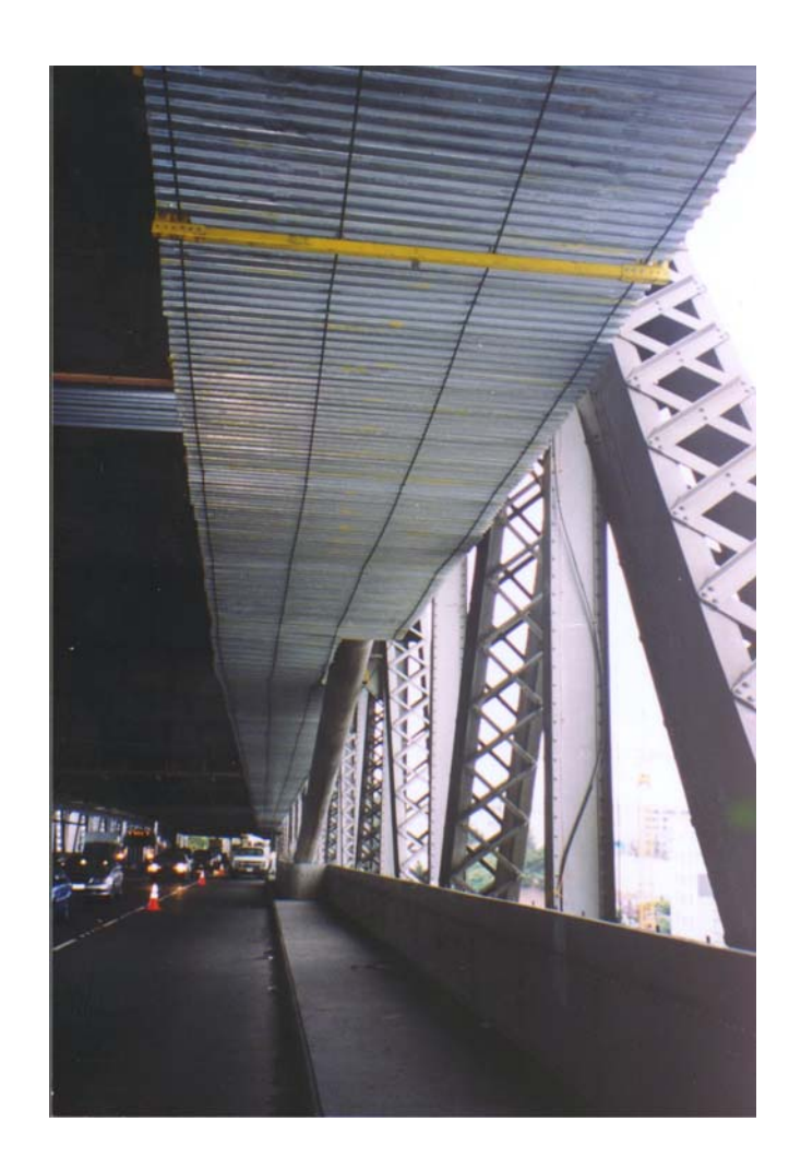
Cable Supported Platform