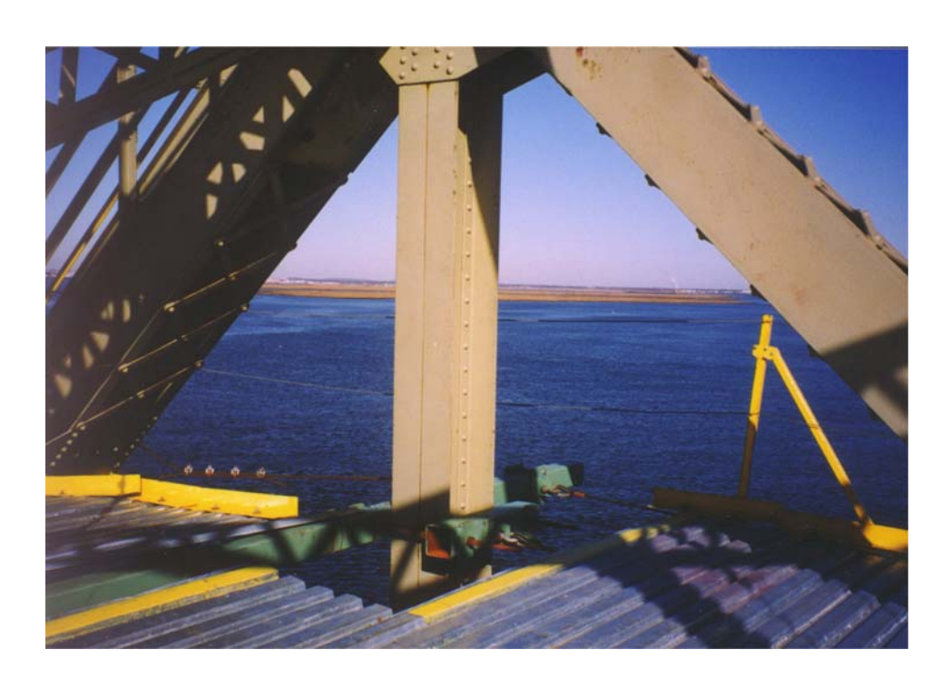
{\bf Intermediate\ Cable\ Supported\ Platform-End\ Connection}