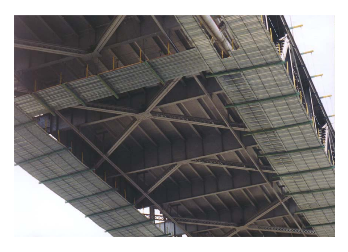
Lower Truss Chord Platforms & Crossover