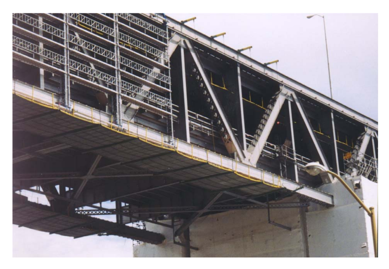
Lower Truss Chord Platforms Scaffolding