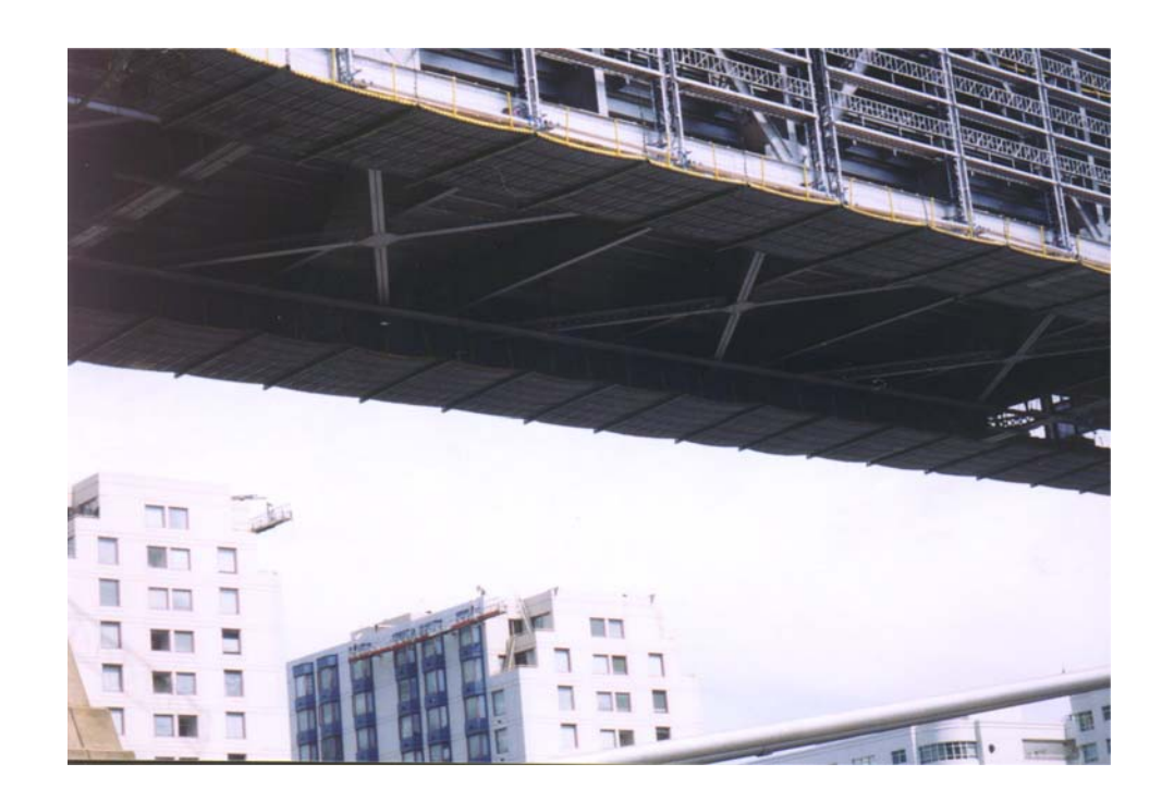
Platforms Below Lower Truss Chords